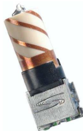
Figure 2 – Sarantel helix antenna (cover removed)

Helix antennas consist of spirally wound elements on a tubular substrate of ceramic or other material (see Figure 2). For best performance, the helix antenna should be oriented vertically with respect to the surface of the earth. Helix antennas do not require a ground plane, but may work better with one.